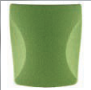
[Fully upholstered back (optional)]